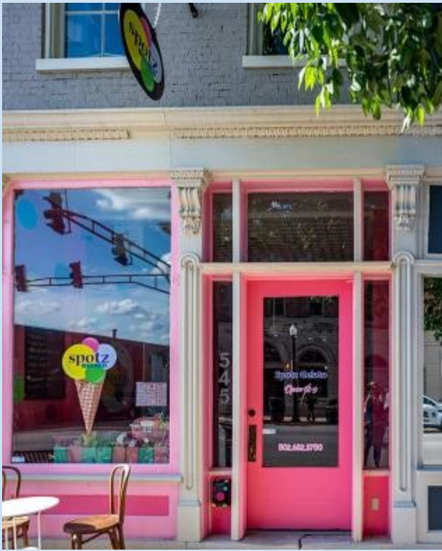
What a great place to cool off in downtown Shelbyville! Homemade gelato and more! Everyone should be spotted at Spotz!