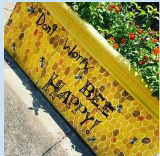
We love how a little paint can liven up the downtown! Planters can provide a little public art. This one and others can be found in downtown Murray!